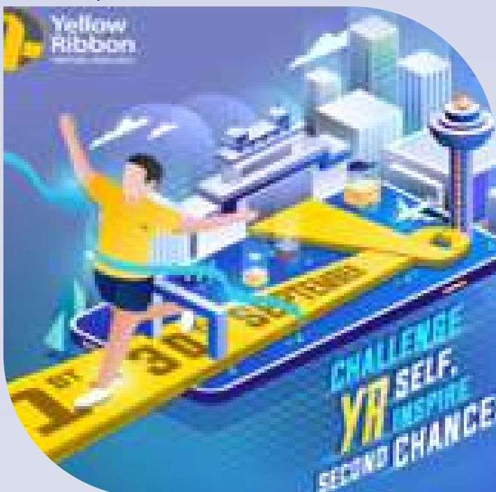
Yellow Ribbon Prison Run