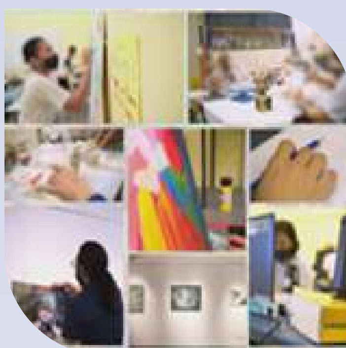
Yellow Ribbon Community Art & Poetry Exhibition