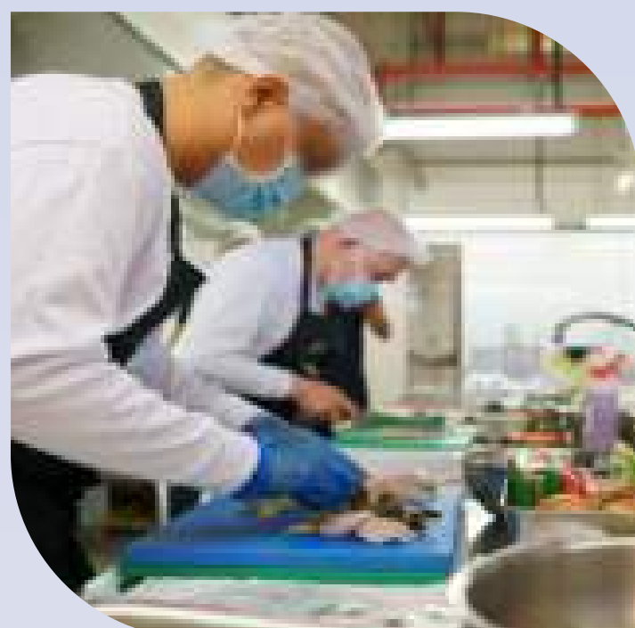
Yellow Ribbon Culinary Competition