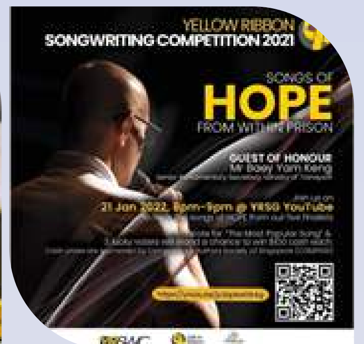
Yellow Ribbon Songwriting Competition