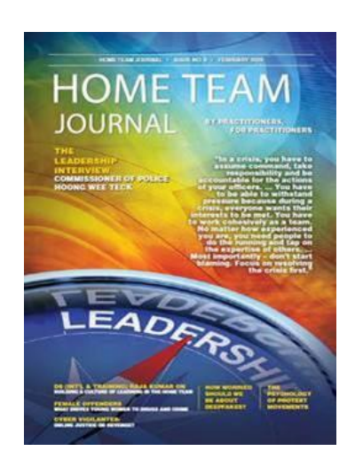
>> To read this issue of Home Team Journal, click here

The issue also includes articles contributed by colleagues from CNB and SPS which shine a spotlight on drugs and female offenders, drawing the connection between gender-specific risk factors and drug abuse. Other highlights include articles by Home Team behavioural scientists, psychologists and research analysts, as well as experts from HTA's global partners. These cover hot-button issues dominating the headlines today, from countering deep-fakes to fighting radicalisation.