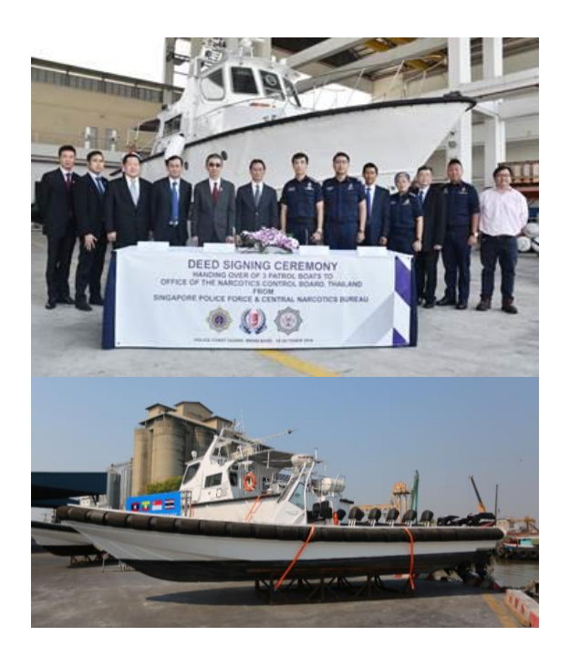
FYI The Golden Triangle is the area where the borders of Thailand, Myanmar and Laos meet. A global hot-spot for the production and trafficking of illicit drugs, it is also the main source of drugs that enter Singapore.

CNB has also provided other forms of capability-building assistance to the Mekong Delta countries; this includes sponsoring officers from Myanmar and Laos for English language courses to enhance communication among officers as well as attaching CNB officers to Thailand's Safe Mekong Cooperation Centre to share their experience on drug interdiction and operational analysis. Supported by MHQ's Policy Development Division (PDD) and International Cooperation and Partnerships Division (ICPD), CNB continues to play an active leadership role, supporting and working with its counterparts in the ASEAN Member States towards a drugfree ASEAN. - Contributed by ICPD