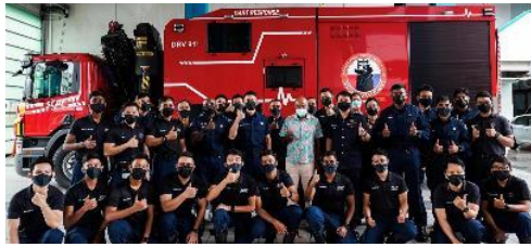
Min K Shanmugam at Jurong Fire Station

The work of our frontliners in safeguarding our safety and security never stops, so that we can enjoy public holidays with a peace of mind. On Deepavali, MIN K Shanmugam and 2MIN Josephine Teo visited ground officers at Jurong Fire Station and Woodlands Police Division to thank them for their dedication and hard work.