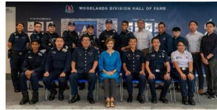
2Min Josephine Teo at Woodlands Police Division