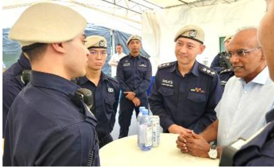
Min K Shanmugam at Protective Security Command