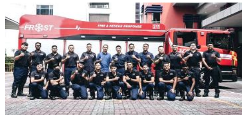
MOS Faishal Ibrahim at Paya Lebar Fire Station