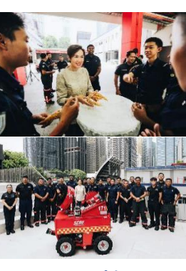
2MIN Josephine Teo with SCDF officers